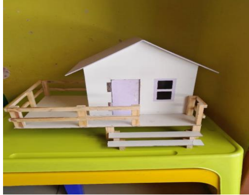
House